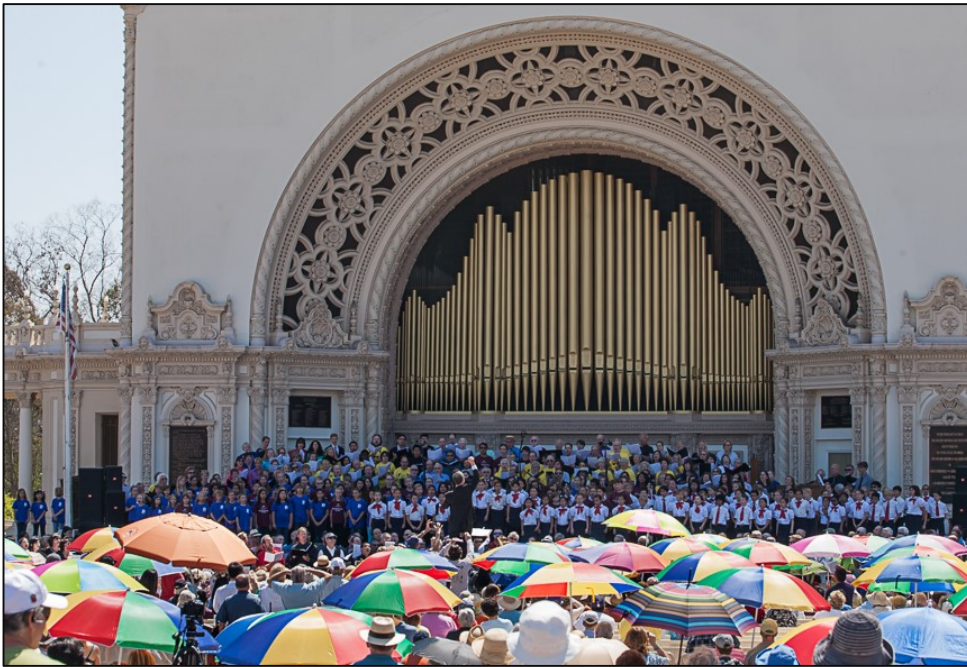
The group sing with all choruses