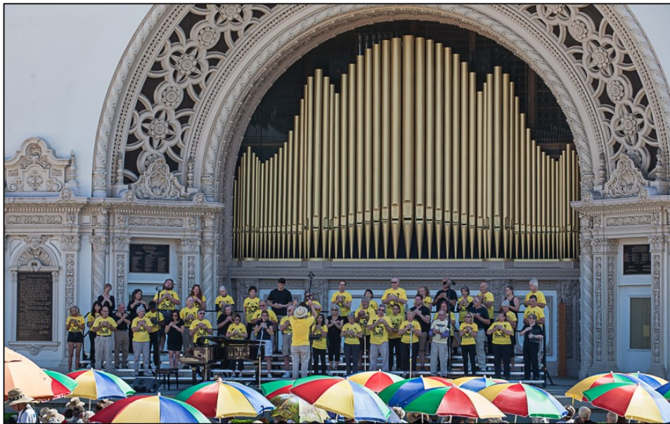
The La Jolla Symphony Chorus performs