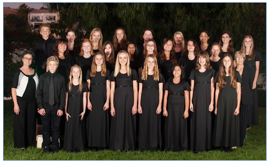
Caprice Chorus of the San Diego North Coast Singers

In 1991 music classes in the schools were discontinued due to severe tax cuts. Sally was asked to begin a community youth chorus to partially fill the music education gap. This was the birth of The San Diego North Coast Singers. Over the next twenty-one years, SDNCS has grown to five ensembles serving over 110 young singers each year. The program provides choral music education for young people from seven to eighteen years of age. It is recognized for its exceptional artistic quality and joyous and spirited performances of songs from diverse cultures. The group is dedicated to collaboration and has a history of adding local professional performers to its concerts, in an effort to demonstrate high-level artistry to young musicians and their families.